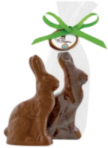
Lake Champlain chocolate bunnies