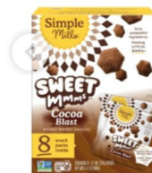
Simple Mills Cocoa blast