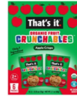
That's It Crunchables