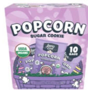
Lesser Evil Sugar cookie popcorn