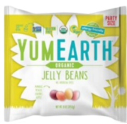
Yum Earth Jelly Beans