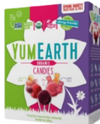
Yum Earth Variety candies