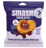
Smash Foods Snack bites