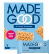
Made Good Crispy squares