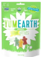
Yum Earth sour littles