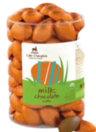
Lake Champlain chocolate eggs