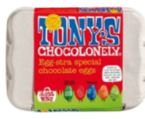
Tony's Chocolate eggs