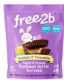
Free2b Sunflower butter cups