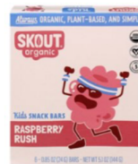
Skout bars Code: homeswaps