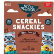
Seven Sundays Cereal snackies