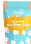
Hearthy Foods Marshmallows