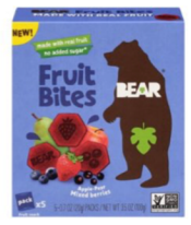
Bear Fruit Bites