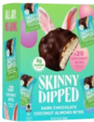
Skinny Dipped Coconut almond bites