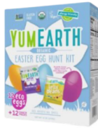
Yum Earth Egg hunt kit