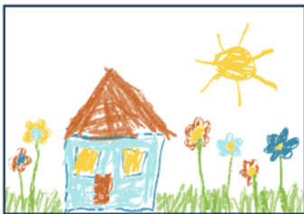
draw a picture