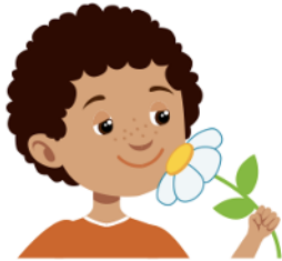
take deep breaths