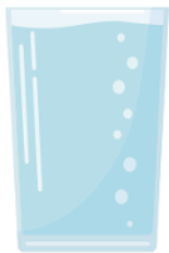
take a drink