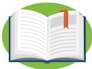
read a book