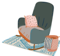
take a break