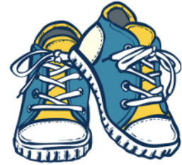
go for a walk