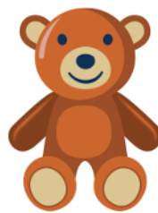
hug a favorite toy