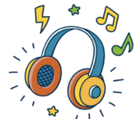
listen to music